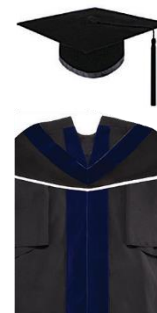
Master of Philosophy

A black robe with zipper and dark blue velvet facings down each side in the front; the gown has bell-shaped sleeves; black hood trimmed with dark blue velvet lining at the inner edge and with silver silk lining throughout; the lining being turned over to the depth of 1 cm; the length of the hood is three and one-half feet; black mortar-board cap with black braid and tassel.