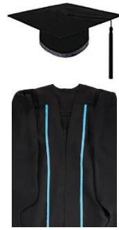
Postgraduate Diploma in Education