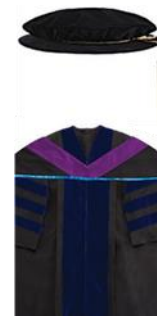
Doctor of Education

A black robe with zipper and dark blue velvet facings down each side in the front; the gown has bell-shaped sleeves with three dark blue velvet strips; black hood trimmed with purple velvet lining at the inner edge and with blue silk lining throughout, the lining being turned over to the depth of 1 cm; the length of the hood is four feet; black bonnet bounded with golden-yellow cord and tassel.