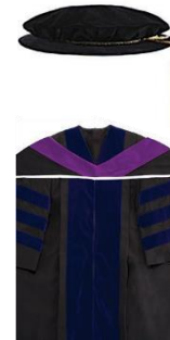
Doctor of Philosophy

A black robe with zipper and dark blue velvet facings down each side in the front; the gown has bell-shaped sleeves with three dark blue velvet strips; black hood trimmed with purple velvet lining at the inner edge and with silver silk lining throughout; the lining being turned over to the depth of 1 cm; the length of the hood is four feet; black bonnet bounded with golden-yellow cord and tassel.