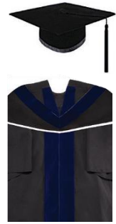
Master of Philosophy

A black robe with zipper and dark blue velvet facings down each side in the front; the gown has bell-shaped sleeves; black hood trimmed with dark blue velvet lining at the inner edge and with silver silk lining throughout; the lining being turned over to the depth of 1 cm; the length of the hood is three and one-half feet; black mortar-board cap with black braid and tassel.