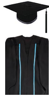
Postgraduate Diploma in Education