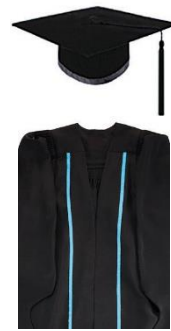
Postgraduate Diploma in Education