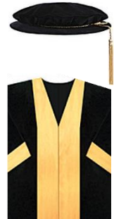
Doctor of Philosophy

A dark green velvet robe of the Oxford pattern with 4” wide dark orange facings in front and around the neck and 3” wide dark orange facings around the sleeves; black bonnet bounded with golden-yellow cord and tassel.