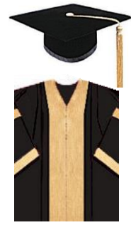
Deputy Chairman, Vice President and Treasurer

A black robe with 4” wide gold facings down (trimmed with 0.5” wide black velvet at outer edge) each side in front; bell-shaped sleeves with two 2” wide gold strips (trimmed with 0.5” wide black velvet at bottom edge); black velvet mortarboard cap with golden-yellow braid and tassel, edged with one 1” wide black ribbon band.